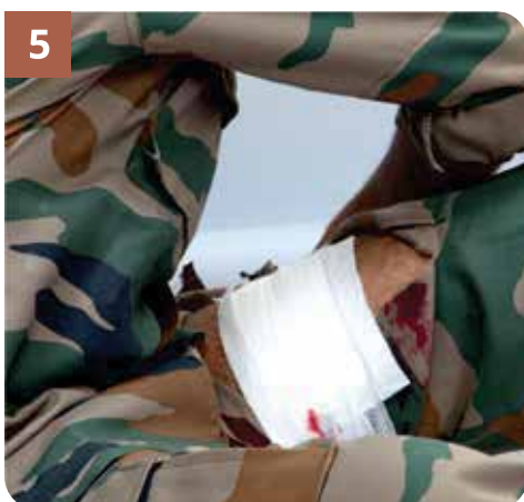
Wrap the dressing around the Limb lightly.