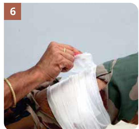
Anchor the end by pressing it on the bandage. End is self anchoring.