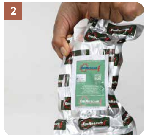
Peel open the dressing.