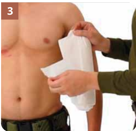
3 Peel off paper liner from the dressing.