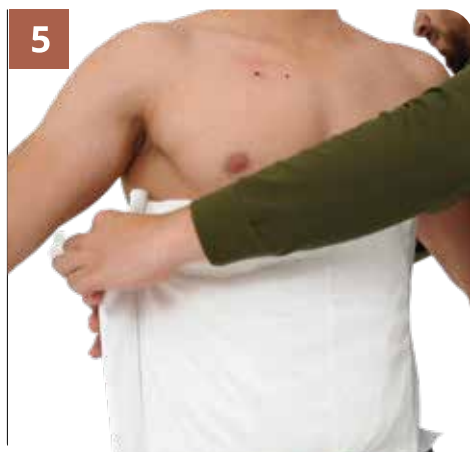
5 Wrap the dressing around the Chest lightly.