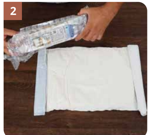
2 Peel open the dressing.