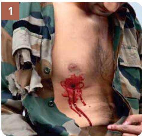
1 Penetrating chest wound