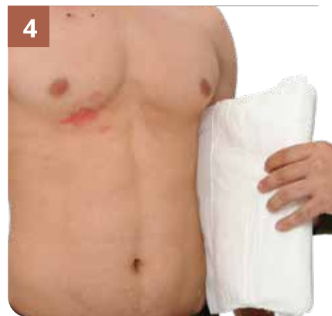
4 Apply adhesive part of dressing before the wound.