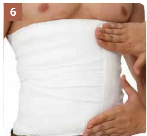
6 Anchor the end by pressing it on the bandage. End is self anchoring.