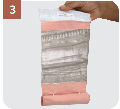
3 Holding knots have been provided between layers of bandage so that bandage would not unfold on its own even when it is dropped on ground