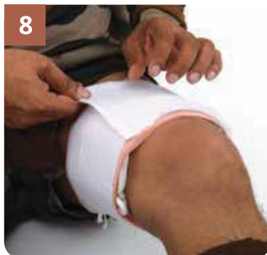
8 End part of bandage is cohesive. Press it on the bandage and it will stick on it.