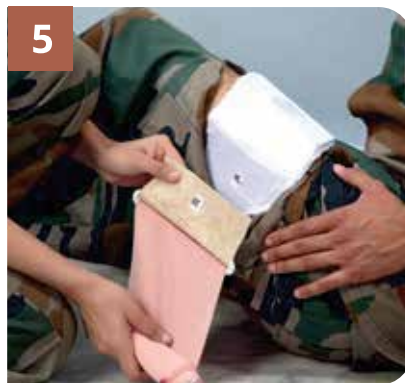
5 Press the free flap '3B' against '3A'