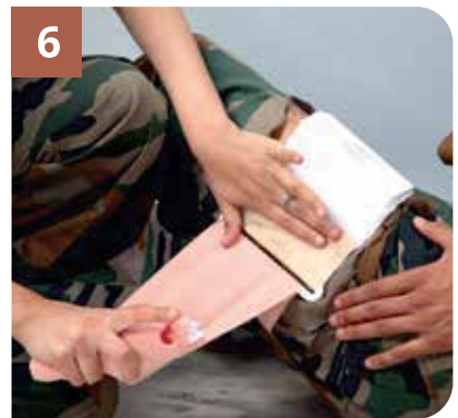
6 Pull the bandage forcefully and wrap it around the limb maintaining strong pull