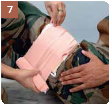
7 Keep on wrapping the bandage tightly.