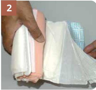
2 Remove release liner from end.