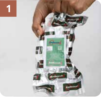
1 Teas open the pouch and take out the inner pack. Peel open inner pack & take out the dressing.