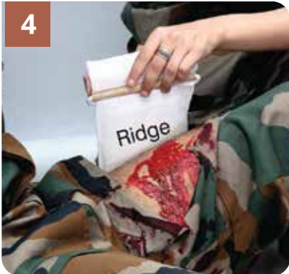
4 Press the end before the wound. The ridge must oppose the bleeding wound. Wrap bandage around the limb.