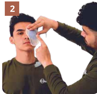
Place the eye shield and press the adhesive patch gently around the eye