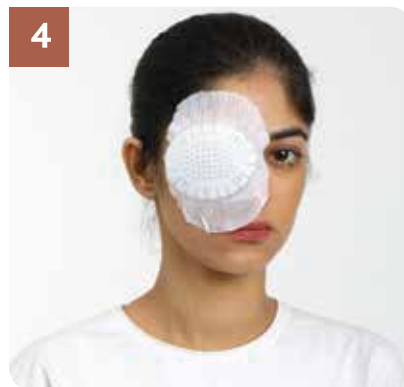
Placement of Eye shield with adhesive patch