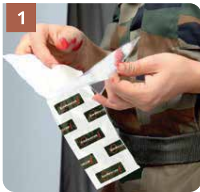
Peel open outer pack & take out eye shield