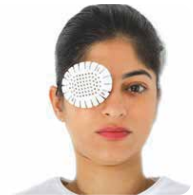
Eye shield without adhesive patch