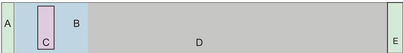
A: Adhesive strip B: Absorbent wound pad C: Rigid ridge D: Main Bandage E: End anchor

Normal systolic blood pressure = 120 mm of Hg 156 gm/sqcm.